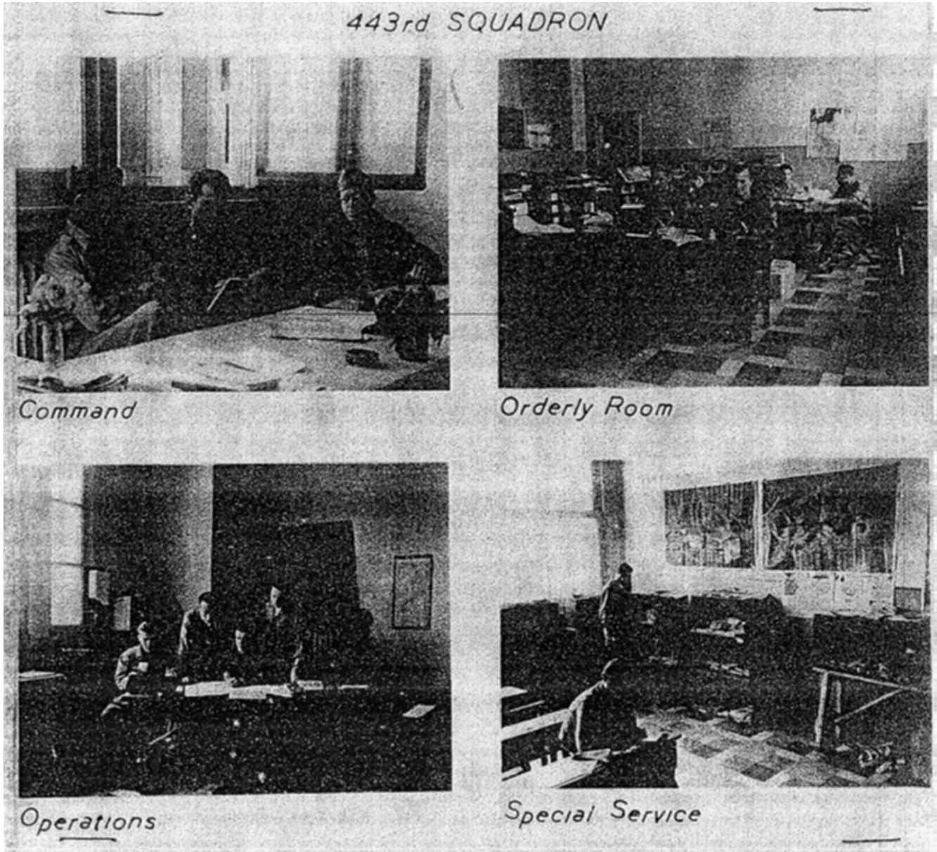
Interior photographs of Headquarters, 443rd Bomb Squadron